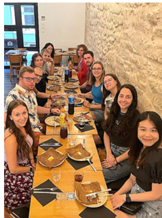
MEET FRENCH PEOPLE