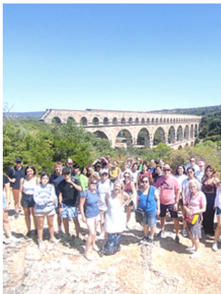
MEET INTERNATIONAL STUDENTS