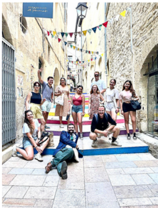
DISCOVER MONTPELLIER AND ITS REGION

There are so many things to see and do! Every week we offer a rich and varied cultural programme to meet other students, practice your French and discover the region!