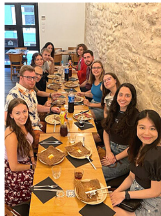
MEET FRENCH PEOPLE