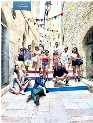
DISCOVER MONTPELLIER AND ITS REGION

There are so many things to see and do! Every week we offer a rich and varied cultural programme to meet other students, practice your French and discover the region!