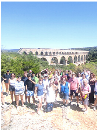
MEET INTERNATIONAL STUDENTS